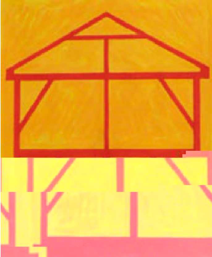
An American Frame, watercolor