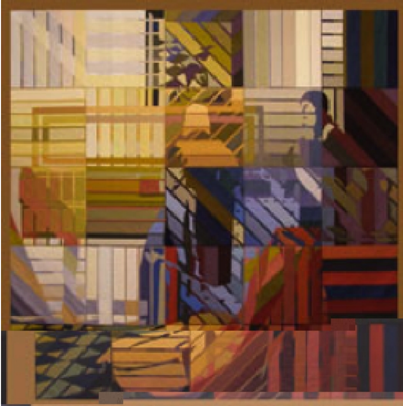
Self-Reflection, pieced, appliquéd cotto